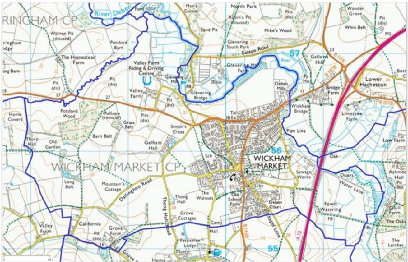
Figure 1: Wickham Market Neighbourhood Plan (WMNP) Area

Date Created: 27-7-2018 | Map Centre (EastngNorthing): 629781 / 256195 | Scale: 1:15076 | © Crown copyright and database right. All rights reserved (00009999) 2018 © Contains Ordnance Survey Data - Crown copyright and database right 2018